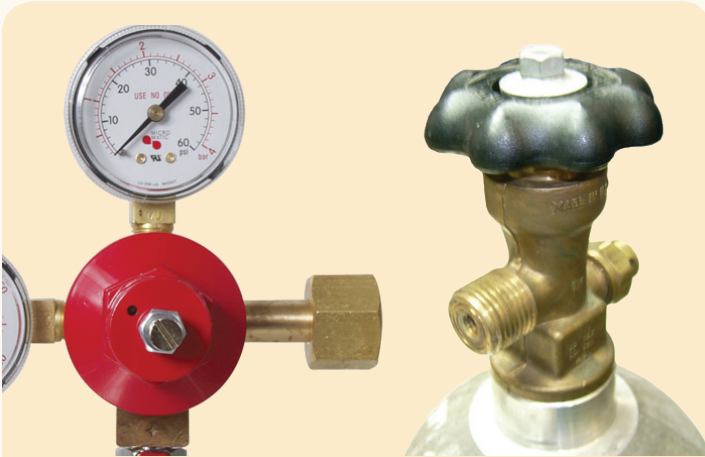
CO2 Regulator and Tank