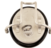
Standard Corny Keg Lid (KEG440A)