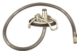
Carbonation Keg Lid (KEG445)