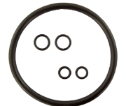
The 5 different O-Rings on a Keg (KEG500-)

The Shell — This is the body of the keg that holds the liquid and is made of stainless steel.