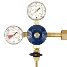
Dual Gage CO2 Regulator With Check Valve (D1060)

The Co2 Regulator essentially takes the pressure of the gas of the top of the tank and reduces it to a lower, controlled pressure. The regulator attaches to the tank with a female hex piece. The pressure going into the regulator is generally around 500-900 PSI, depending on the temperature of the tank.