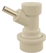
Gas-In Quick Disconnect (KEG710)

The regulator connects to the keg via a Gas-In Quick Disconnect. The Gas-In Quick Disconnect is connected to the regulator with 5/16" I.D. tubing. A majority of Co2 equipment has 5/16" barbs, which is why 5/16" tubing is commonly used for gas equipment. However, the Gas-In Q.D. has a 1/4" barb on it so the 5/16" tubing must be attached and secured with a hose clamp.