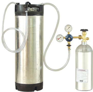
A typical draft set-up (KEG400)